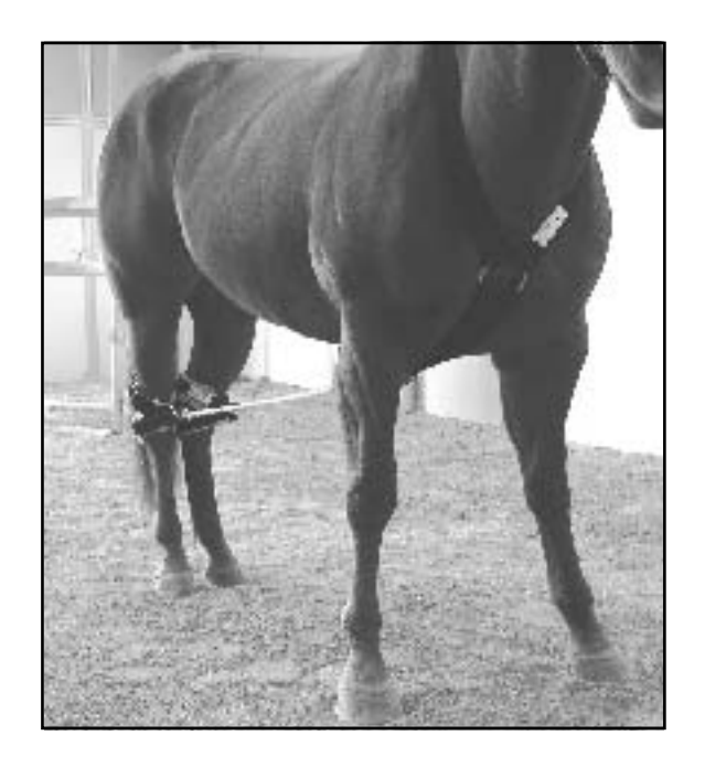
FIGURE 1 - Properly Fitted Breeding Hobbles