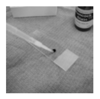
Figure 2. Placement of semen on slide.