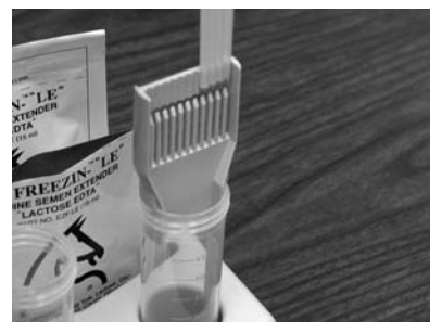
Figure 4. Allign filled straws (P/N 537-670-CLE) with guides on the ARS Bubbler Comb.