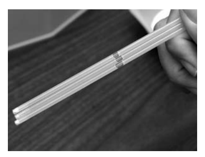
Figure 9. Gently shake straws until air buble is in the center of the straw.