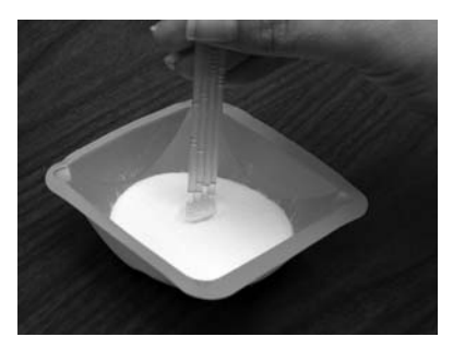
Figure 7. Seal straws with sealing powder (P/N 537-671).