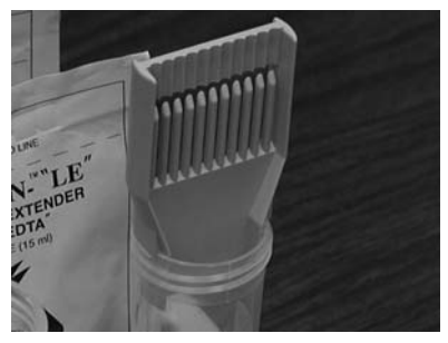
Figure 2. Bubbler Comb should fit snuggly inside tube.